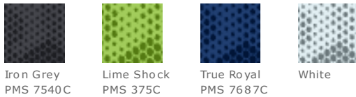
Iron Grey PMS 7540C