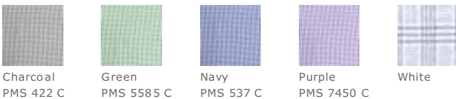
Charcoal PMS 422 C Green PMS 5585 C Navy PMS 537 C Purple PMS 7450 C White